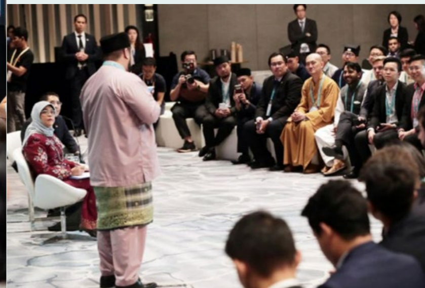
Heart of God Church participants (seated far right) at the fireside chat with President Halimah Yacob.