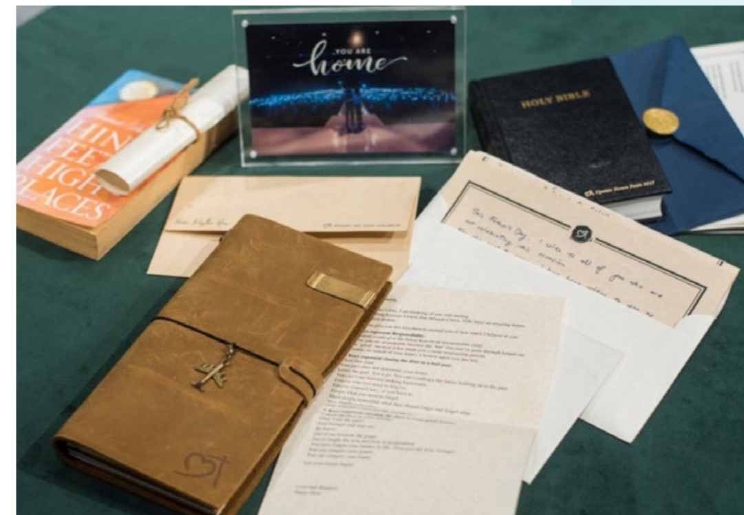
Personalised letters and gifts given to youths who come from broken families every Father's Day and Mother's Day.